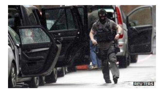
Back to top

He added: "The police came in to our reception and told us we had to evacuate the building immediately."