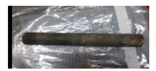
Back to top

There were no evacuations at the hospital.