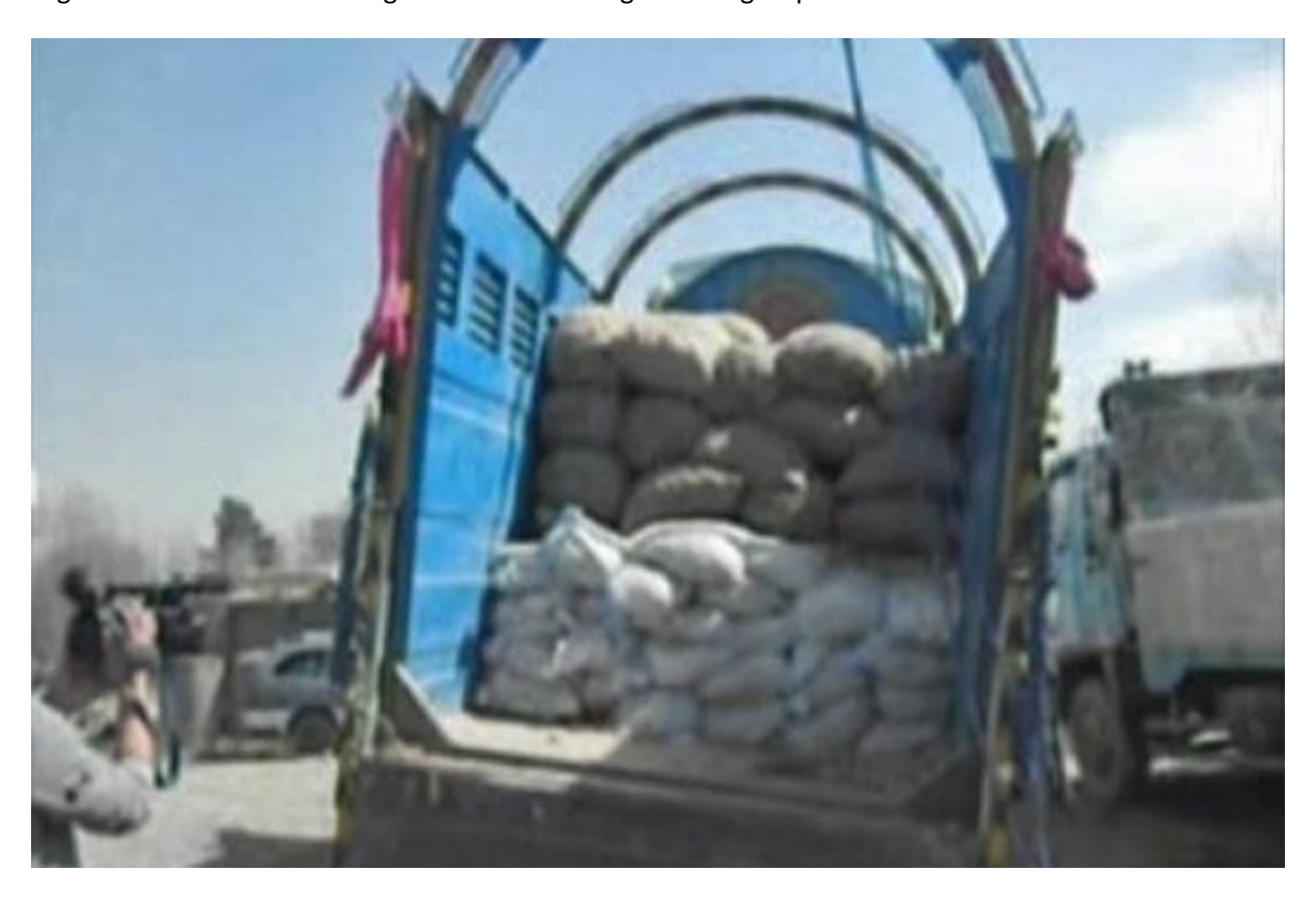
Back to top

Afghanistan has been accusing Pakistan of backing militant groups to further its interests.