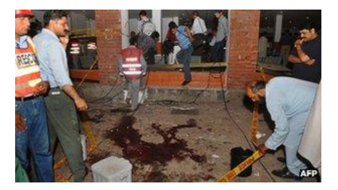
Back to top

In July of that year two suicide bombers attacked the Data Darbar Sufi shrine in Lahore, killing at least 42 people. Two months before that, gunmen launched simultaneous raids on two mosques of the minority Ahmadi Islamic sect in the city, killing more than 90 people.