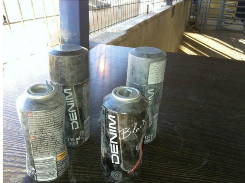
Back to top