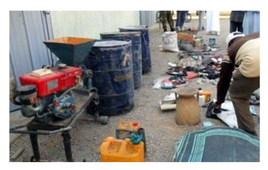
Raid of a suspected Boko Haram bomb making factory by the security forces [See JTF Busts Another Boko Haram Bomb Factory, Kills Three]

The RAPID Weekly News Update is a weekly collection of unclassified media and news bulletins focused on noteworthy improvised explosive attacks and trends in the EOD/C-IED community. To subscribe to this weekly publication and/or to receive additional IED-related reports, please request a RAPID login at <a href="https://rapid.a-tsolutions.com">https://rapid.a-tsolutions.com</a> using your government (.mil or .gov) email account.