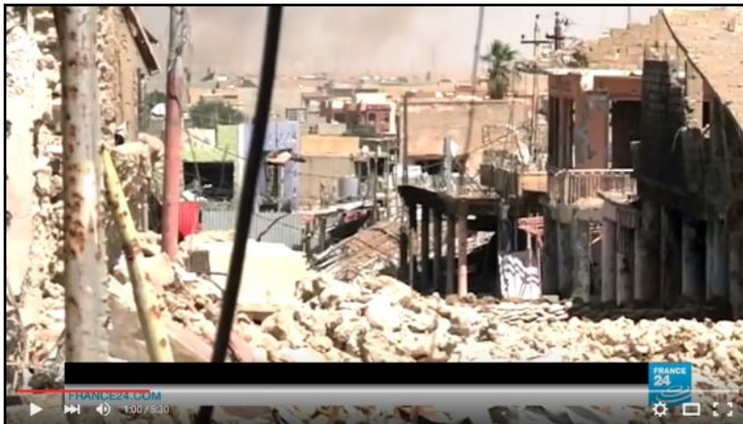
Figure 5. View of the City of Sinjar (video link)

had already exfiltrated from the area as the Kurdish forces made gains. A few snipers stayed behind, as the Kurds began to claim victory, to harass and prevent complete Kurdish freedom of movement. Additionally, clearing the city of booby-traps and other kinds of IEDs slowed free movement within the city. In one mass grave, for example, ISIL rigged bodies to explode when moved. 18