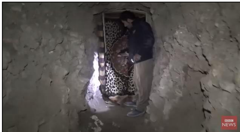
Figure 2. ISIL tunnels in Sinjar (video link)

During the next fifteen months, ISIL emptied the city of most of its inhabitants and prepared battle positions in anticipation of an inevitable major Kurdish attack to retake the city. Kurdish forces entered and captured parts of Sinjar, but were unable to gain complete control.