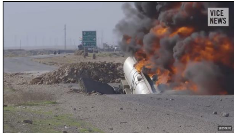
Figure 4. Peshmerga attack from East (video link)

While some Kurdish fighters attacked from the north, others moved from the east and the west of Sinjar to cut off ISIL's supply line along highway 47 between Mosul and Raqqa. Fighters, mostly PKK, attacked from the west while a predominately Peshmerga force attacked from the east. ISIL utilized practiced techniques in attempting to prevent its supply line from being cut and its units surrounded. ISIL used marksmen, snipers, ambushes, IEDs, and suicide bombers along the road and in the city to block movement. The coalition force eventually cleared the road after a few days of slow and cautious movement. Most of the ISIL fighters