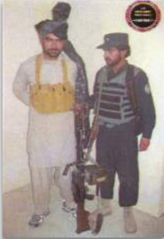
Photo ideally depicts detainee standing next to ANSF (use ANSF to hold evidence). Do not put detainee in submissive pose (avoid old money shot). Photograph items where found or at least centrally collected. Try to have ANSF in each photo (Afghan Face). Have ANSF sign and thumbprint photo for case file. Ask the Saranwal for the best way to photograph for the case.