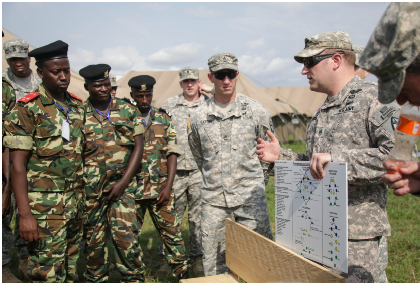
560th Battlefield Surveillance Brigade Soldiers teach infantry tactics to the Cameroon Army during Central Accord 2014 (CA 14) in Cameroon, Africa, March 11, 2014. CA 14 is a culmination of military forces of Central Africa, the Netherlands, and the United States conducting a combined joint training exercise in order to sustain tactical proficiency, improve multi-echelon operations, and develop multi-national logistical capabilities in an austere forward environment.