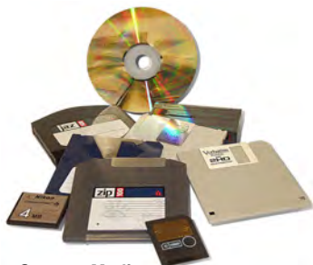
Storage Media (CDs, DVDs, Floppy Disks, Zip Disks and Flash Cards)