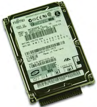
Laptop Hard Drive