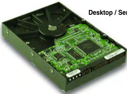
Desktop / Server Hard Drive