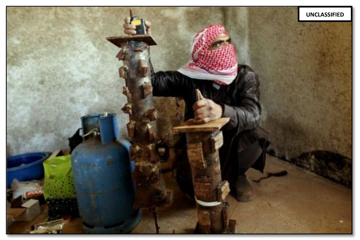
Syrian Rebels Take On Army Tanks With Homemade Bombs