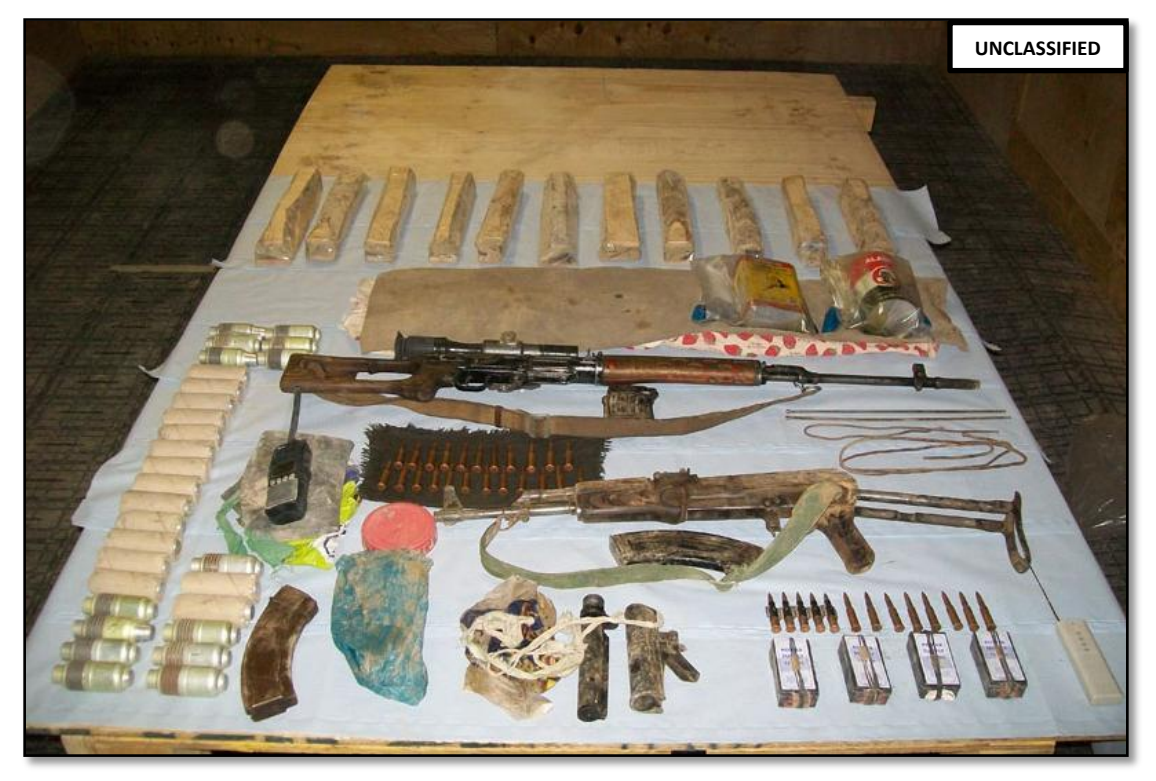
Troops Seize Taliban Weapons/Explosives Cache