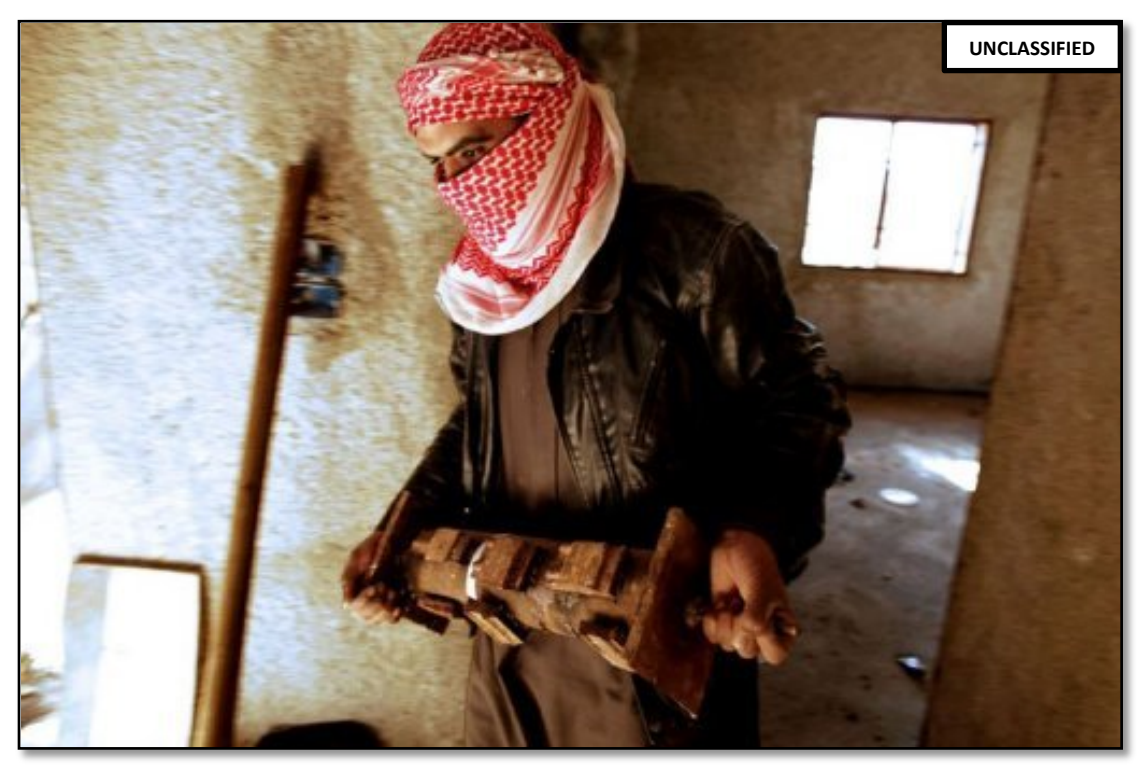
Syrian Rebels Take On Army Tanks With Homemade Bombs