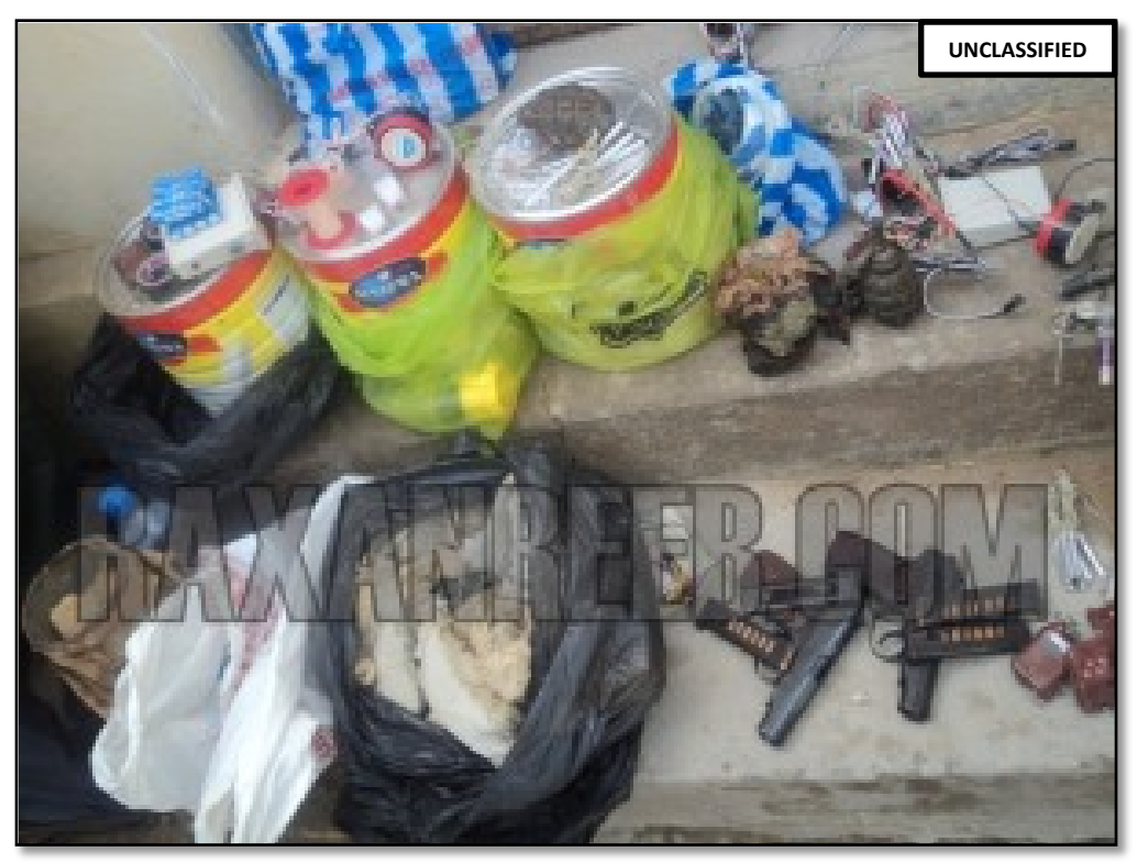
Puntland Law Enforcement Officers Capture Explosives And Weapons