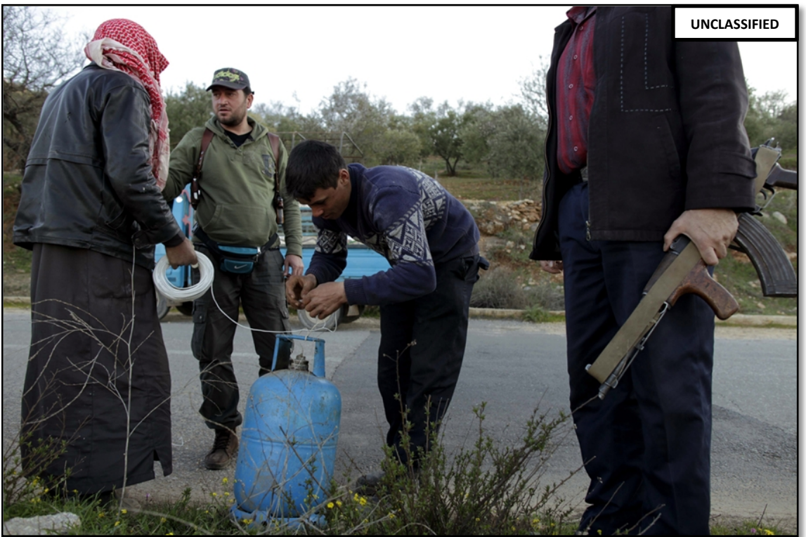
Syrian Rebels Destroy Highway Leading To Mountain Fortress In Idleb