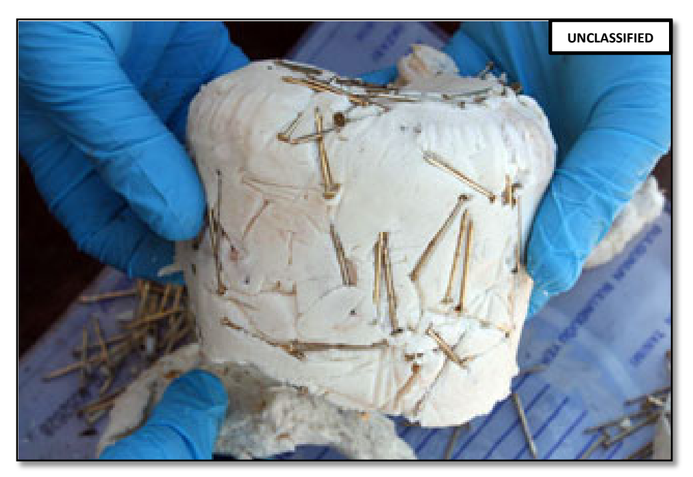
'Nevruz Bomb' Discovered In Istanbul