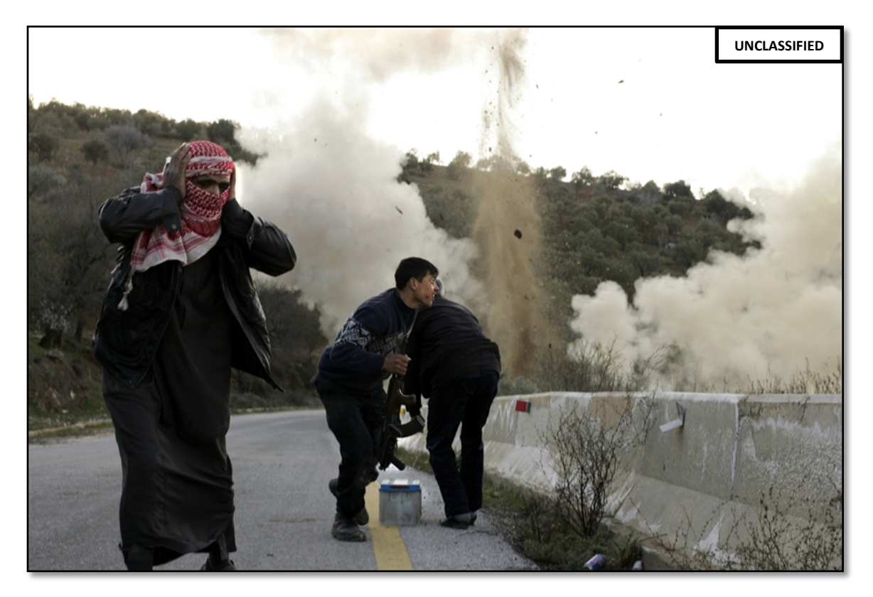
Syrian Rebels Destroy Highway Leading To Mountain Fortress In Idleb