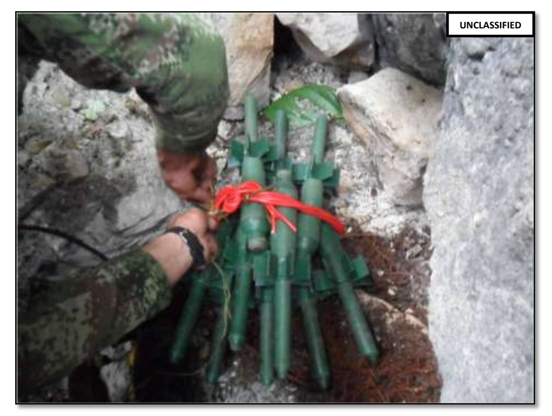
FARC Explosives Neutralized