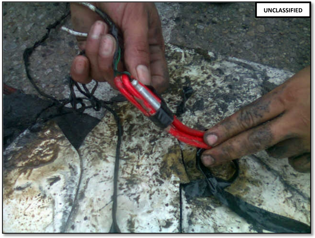
Two FARC Members Die As A Result Of Military Operations In Arauca