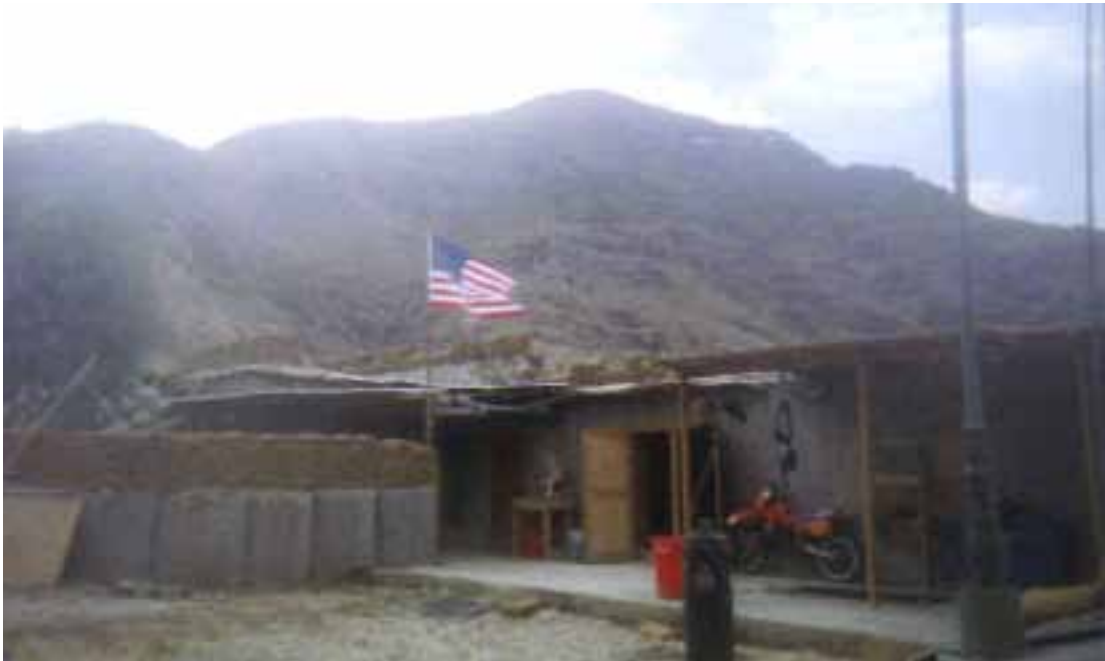
Someday you too could fly an American flag outside your firebase, as we did at ours here in Asadabad.

Not everyone will be able to do this nor should they. But for those warriors who are qualified and feel the calling, it will be the adventure of a lifetime.