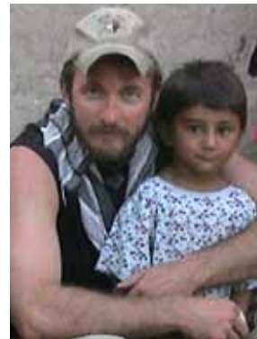
MAJOR JIM GANT UNITED STATES ARMY SPECIAL FORCES

There is no doubt it could be done again.