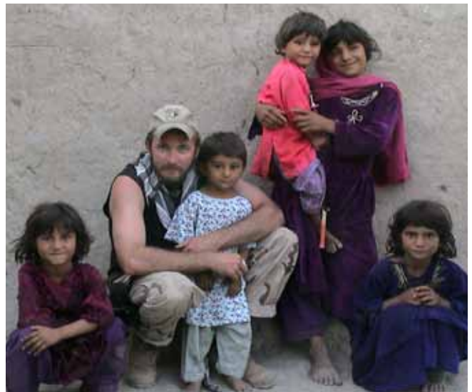
Their families became our families.

Another very enjoyable, insightful and important part of our conversations was discussing the war