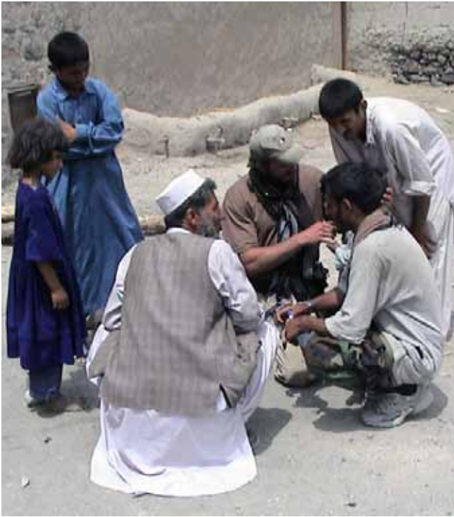
Playing with the kids. A lot of trust was built between my team and the tribe by the way we treated their children.