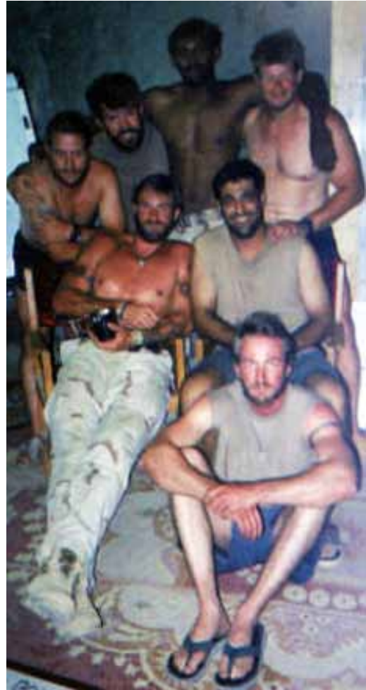
The Original Six. This is not a good quality photograph—taken in near dark with a marginal camera—but it may be the only picture I have of the original six members of ODA 316. Yes, there were only six of us during our first three months of fighting in Mangwel.

BOTTOM LINE: A TET strategy will have to be given the time and patience to do its work. But as our teams continue to establish themselves, one tribe at a time, their influence will reach a tipping point and become a far-reaching strategic influence. ▶◀