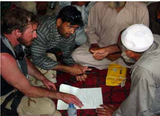
One of Sitting Bull’s mujahadeen commanders describes ambush tactics they used against the Soviets. I loved these sessions and I learned a lot. The tribesmen enjoyed being able to tell us stories of their great battles.