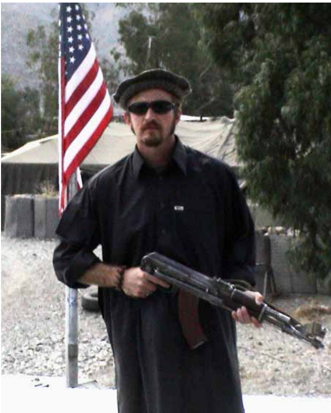
For some of our missions we dressed in Afghan garb, especially when we didn’t want the Taliban to know our teams were operating in certain areas. Here I’m in the local garb with AK-47 ready to go. This is my favorite personal photo from Afghanistan.

BOTTOM LINE: The GIROA (Government of the Islamic Republic of Afghanistan) must find a way to incorporate the historical tribal structures into the national political system. It will not look like anything we can envision at this point, and may vary from province to province or even from tribe to tribe. But it can be done. Tribal Engagement Teams can help facilitate this. ▶◀