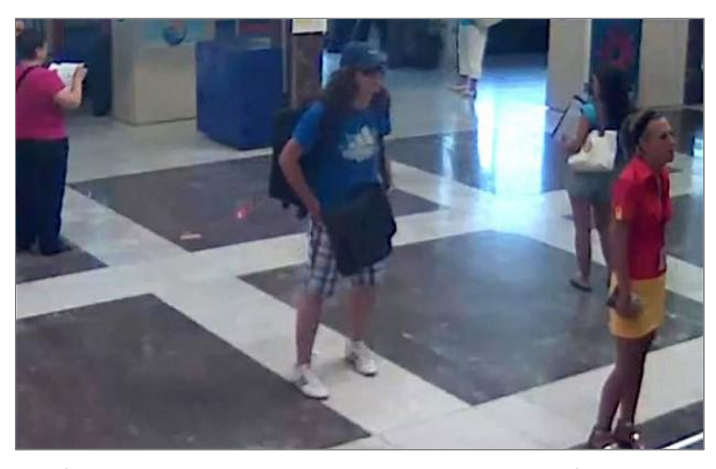
CCTV images of the suspected bomber at Burgas airport in Bulgaria ahead of the attack on the Israeli tour bus

The RAPID Weekly News Update is a weekly collection of unclassified media and news bulletins focused on noteworthy improvised explosive attacks and trends in the EOD/C-IED community. To subscribe to this weekly publication and/or to receive additional IED-related reports, please request a RAPID login at <a href="https://rapid.a-tsolutions.com">https://rapid.a-tsolutions.com</a> using your government (.mil or .gov) email account.