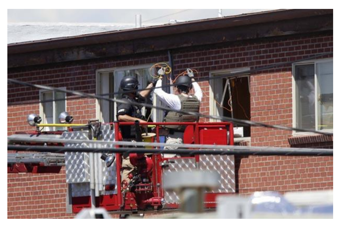
Back to top

Police say the former neuroscience graduate student presented a far different figure last Friday when, dressed in a gas mask and body armor and toting three guns, he opened fire at a packed midnight show of "The Dark Knight Rises" at a theater complex in the Denver suburb of Aurora in the early hours.