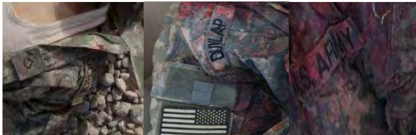
These pictures were cropped to show how the uniforms had the U.S. patches, name, & rank.