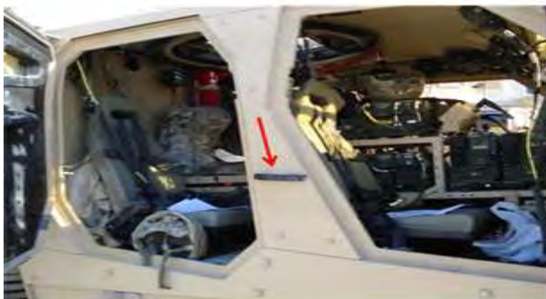
Fig 1: Proper Hand Hold