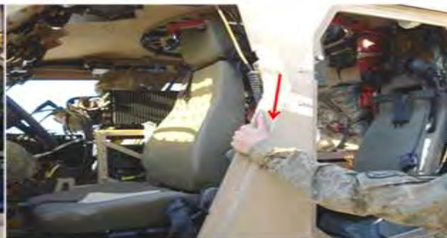
Fig 2: Improper Hand Hold

THIS PAGE IS CLASSIFIED NATO/ISAF UNCLASSIFIED