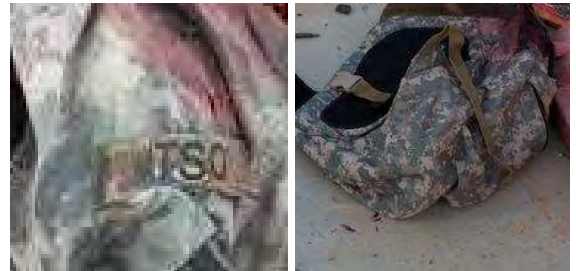
Current INS attacks sport U.S. Military ACU uniforms and backpacks

Granted this sounds farfetched and like a James Bond movie scene but how else is INS/TB obtaining the uniforms? Having someone on the inside is always the easy answer and it can be as simple as rummaging through the FOBs, COPs trash. Soldiers often throw away unserviceable uniforms, boots, and often get careless and leave personal information (PI) from gifts, care packages and or envelopes. Unlike Iraq, we were asked to keep OPSEC a priority: