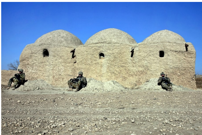
Photo (above): This photo showing Soldiers from the 2nd Squadron, 38th Cavalry Regiment, 504th Battlefield Surveillance Brigade, leaning against a mud wall during a break from combat operations in Spin Boldak district, Afghanistan, was recognized by Business Insider as one of the 65 most beautiful photos of the U.S. Military from 2012 (January 9, 2012).