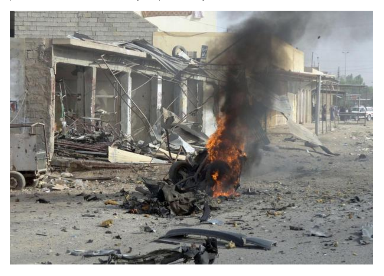
Back to top

But large-scale bombings still come once or twice a month and security forces have been unable to prevent such the attacks, even though they were on high alert this week.