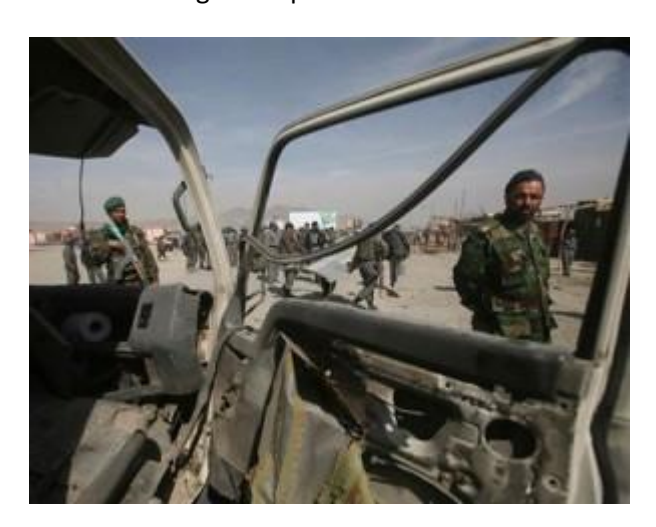
Back to top

Taliban militants group claimed responsibility behind the attack. A spokesman for the Taliban group Qari Yousuf Ahmadi said at least 8 Afghan police forces including one of their commander, Naqibullah was killed following the explosion.