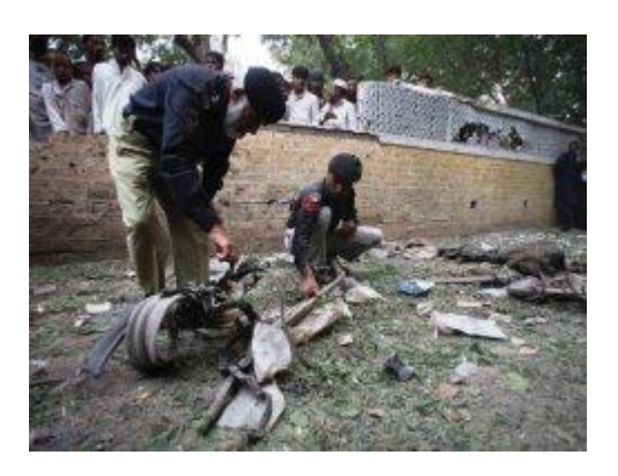
Back to top

No group claimed responsibility for both blasts.