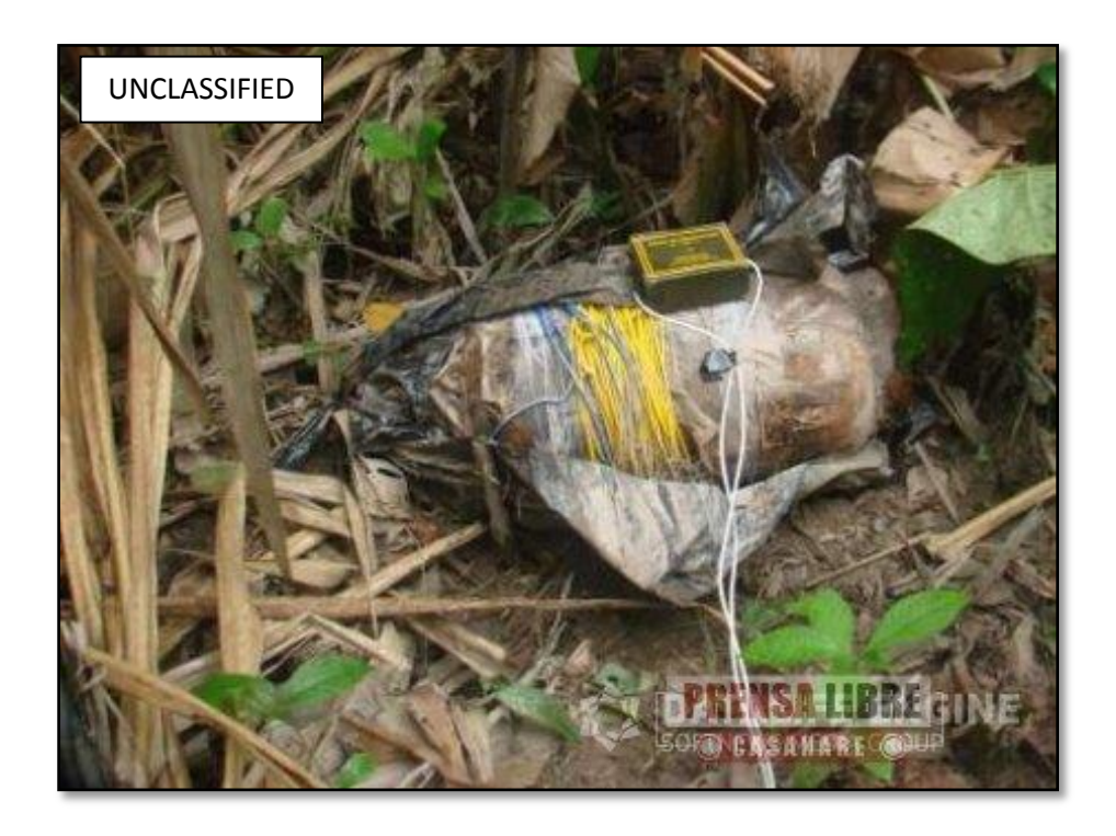
Two Vehicles Recovered In Arauca