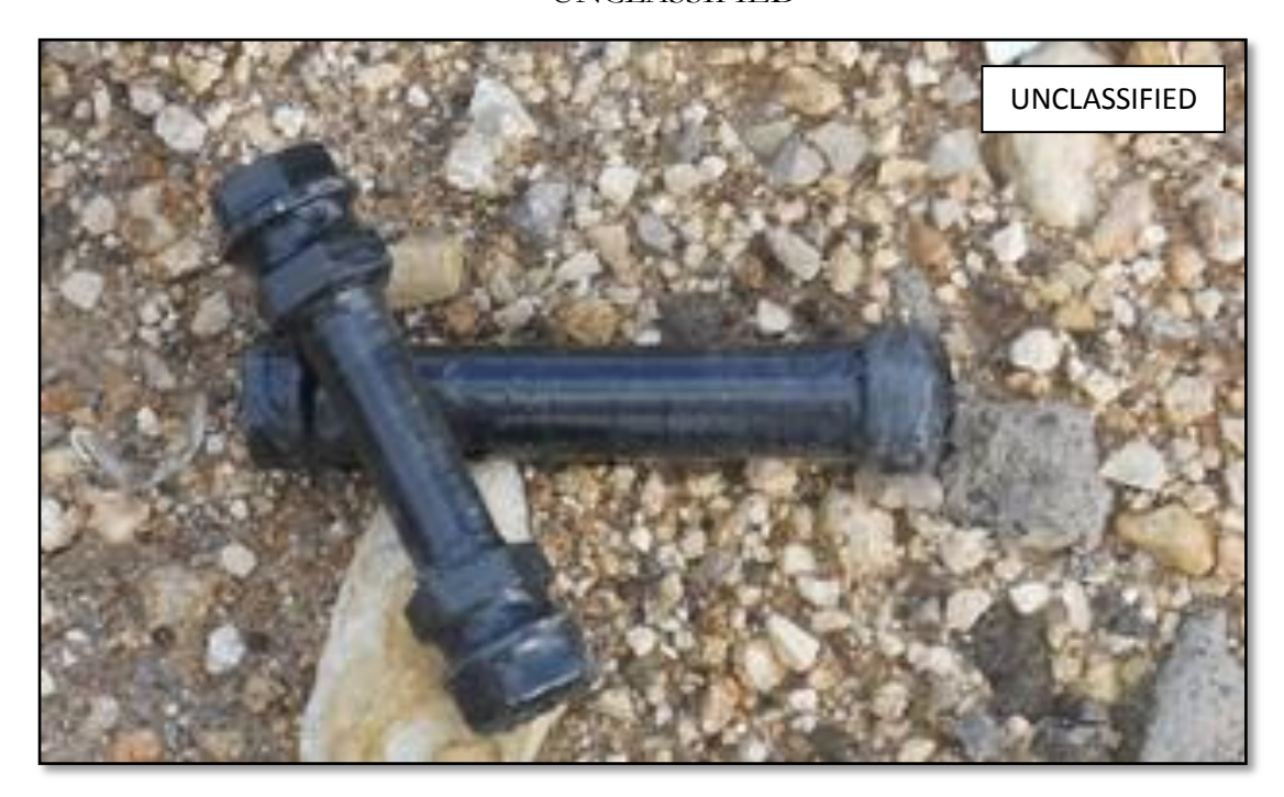
Palestinians With Bombs Caught En Route To Court