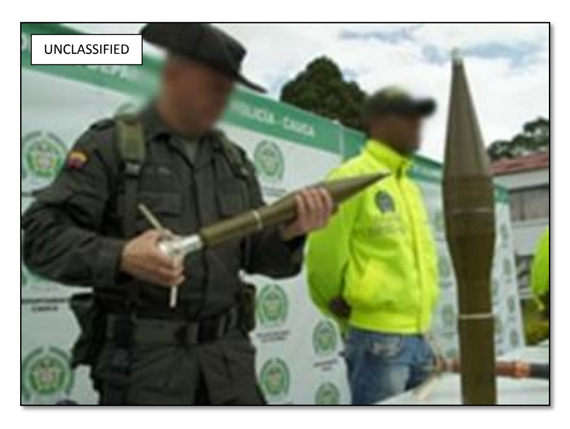
Anti-Tank Missiles Seized From FARC In Cauca