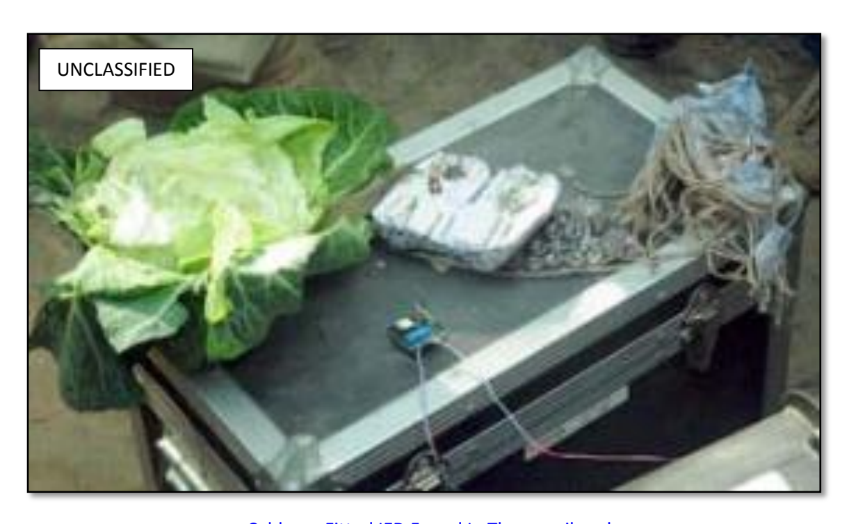
Cabbage-Fitted IED Found In Thangmeiband