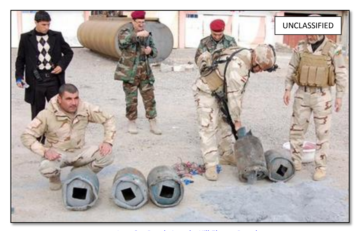
<u>Iraq Car Bomb Attacks Kill Eleven People</u>