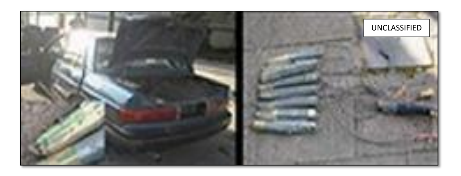
Car Bomb Found Near Texas-Mexico Border