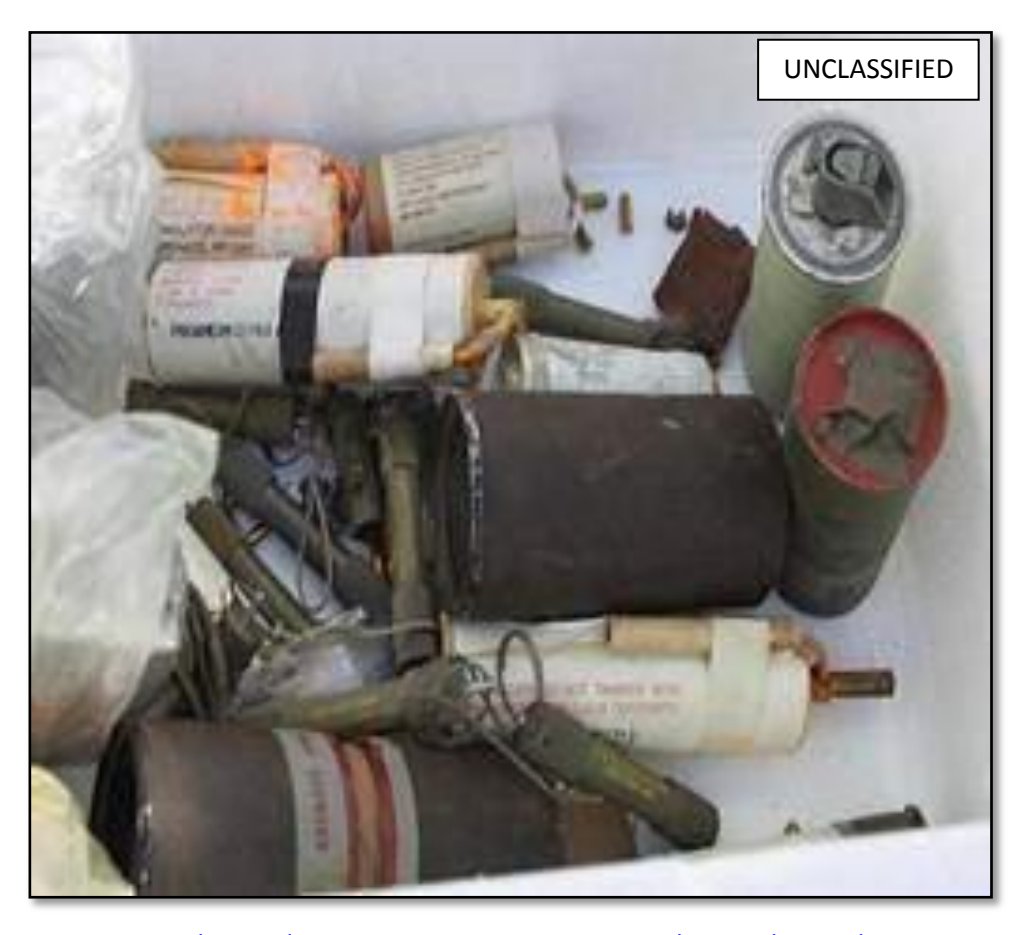
Bomb Squad Investigates Gas Containers And Grenade Simulators