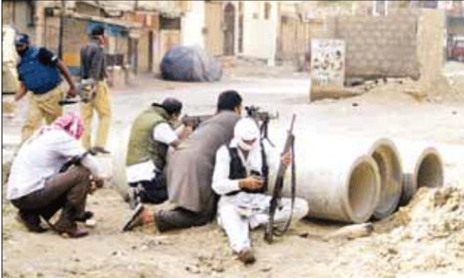
کراچی: لیاری میں بیمر کو مظاہرین سے جھڑپوں کے دوران سادہ کپڑوں میں پولیس اہلکار جدید ہتھیاروں سے فائرنگ کر رہے ہیں جبکہ دو نقاب پوش اہلکار اپنی گنتوں کو لوڈ کر رہے ہیں (پی پی آئی)