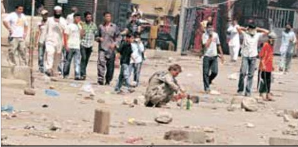
لیاری میں پولیس سے جھڑپ کے دوران ایک شخص پٹرول بم بنا رہا ہے (تصاویر جنگ)