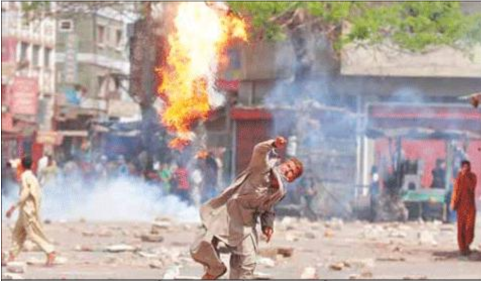
لیاری میں ہنگامہ آرائی کے دوران ایک شخص پولیس پر پٹرول بم پھینک رہا ہے