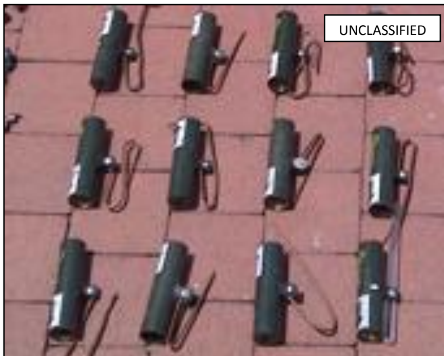
FARC Explosives Seized In Popayan