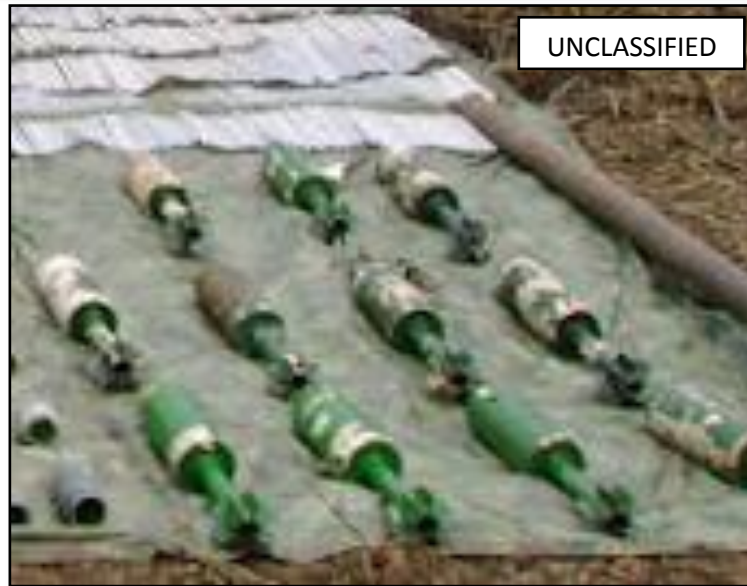
Military Seizes FARC Explosives Cache In Cauca Tambo