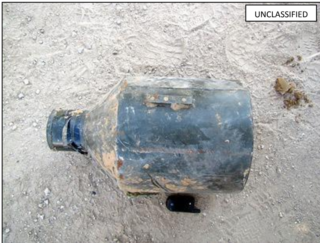
IED Discovered On Israeli-Egypt Border