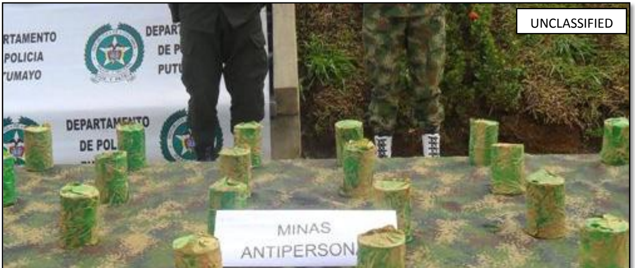
Police And Army Seize Explosives In Putumayo