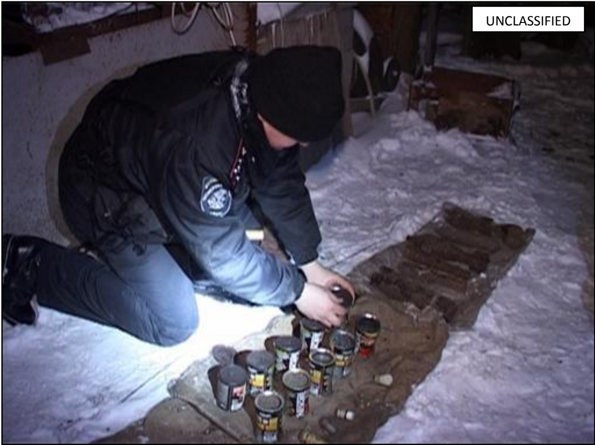
Explosives Discovered In Beehives In Odessa