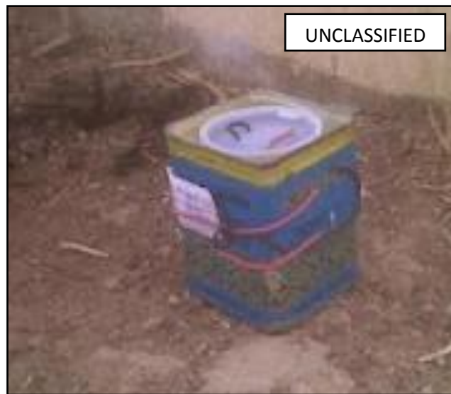
Four Explosive Devices Dismantled In Hama