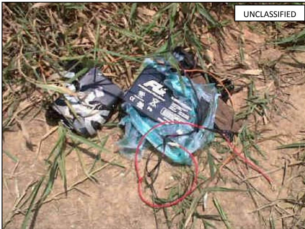
Second Discovery Of Explosives In Caguan