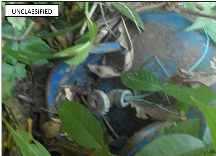
Army Seizes Explosives In Arauca