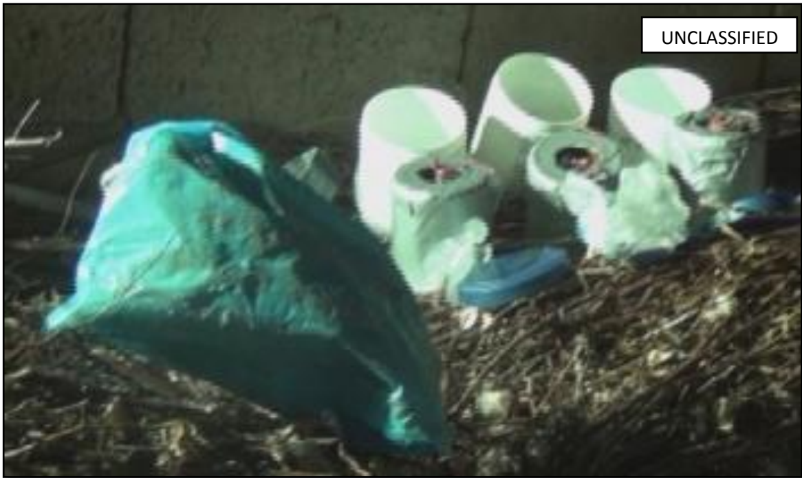
Explosive Device Seized In Turkey