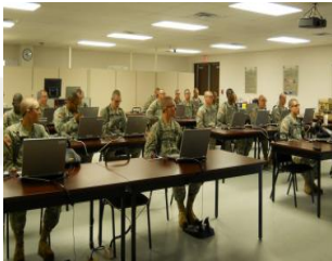
VBS2 Class Room