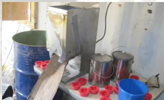
HME Lab Search House