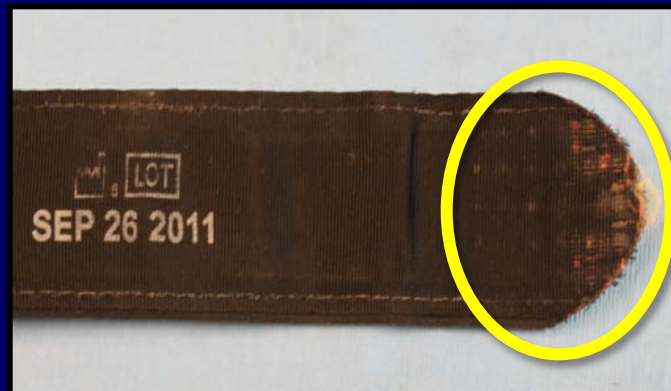
Red tip scraped off