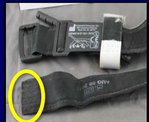
Entire tip cut off